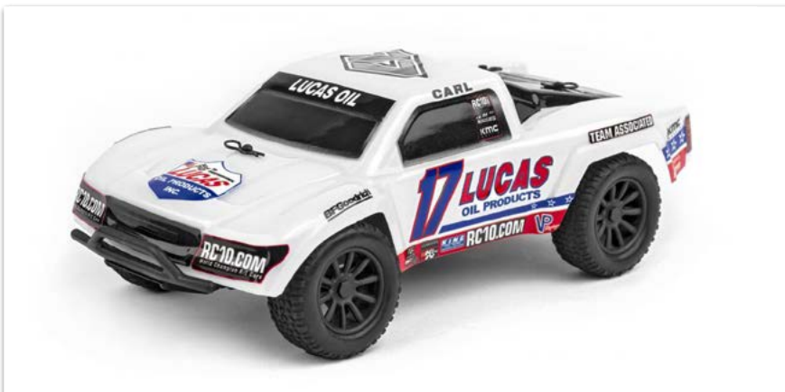
SC28 Ready-to-Run Lucas Oil Edition