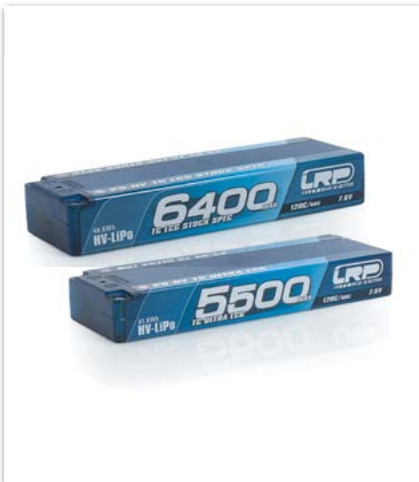
P5-HV TC LCG Stock Spec GRAPHENE 6400mAh P5-HV TC Ultra LCG GRAPHENE 5500mAh