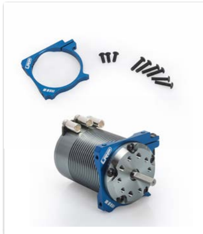
LRP WorksTeam Alum. Fan Mount