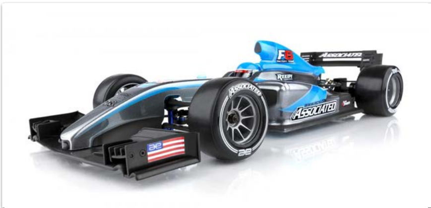
RC10F6 Factory Team Kit