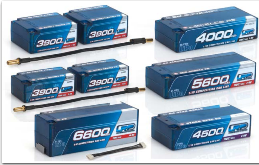
LRP Competition Car Line LiPo batteries