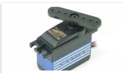
Sanwa ERS-963 servo