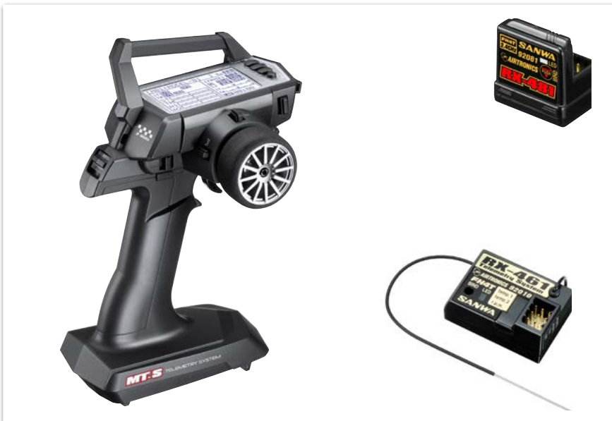
Sanwa MT-S transmitter with RX-481 or RX-461 receiver