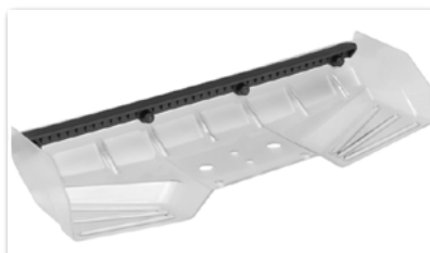
JConcepts Hybrid Wing 1/8