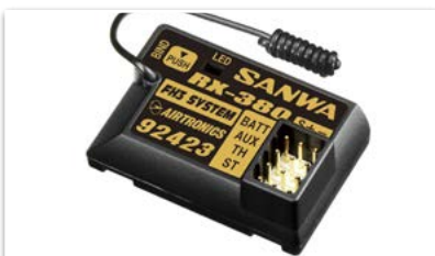
Sanwa RX-380 Receiver FH3 3-Channel