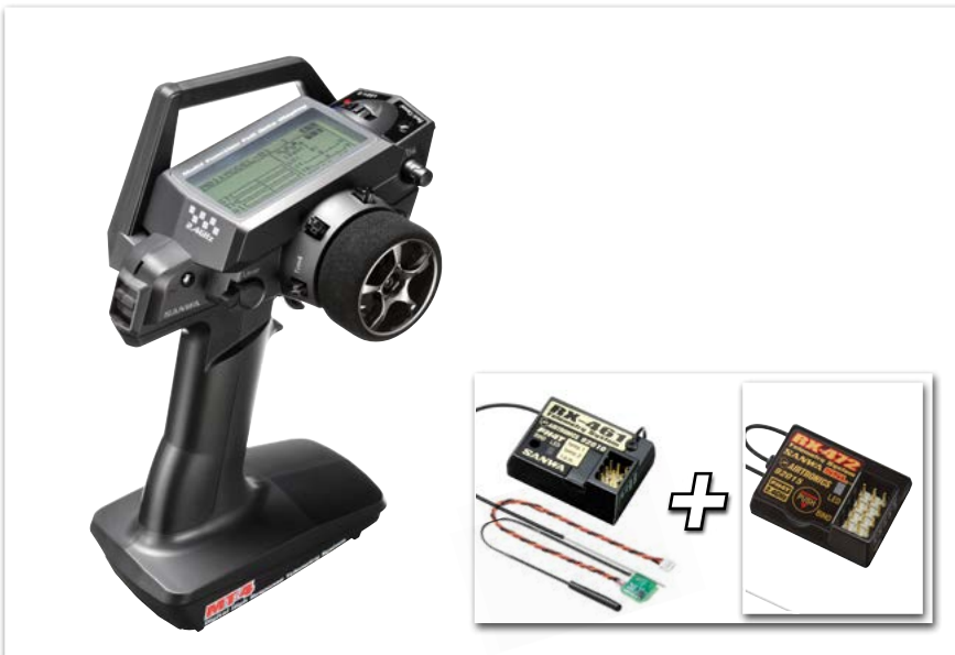
Sanwa MT-4 Set (TX+RX) + RX-472 Receiver Combo