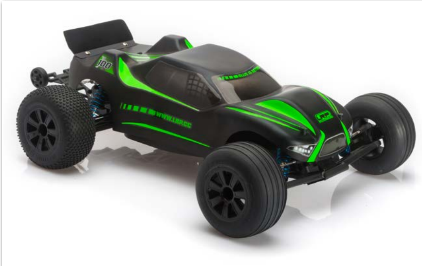
LRP S10 Twister 2 Extreme-100 Brushless Truggy 2.4Ghz RTR