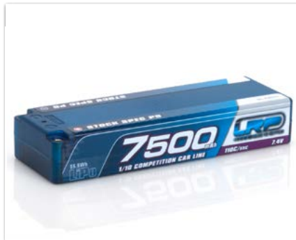
LRP 7500 - TC Stock Spec P5 - 7.4V LiPo