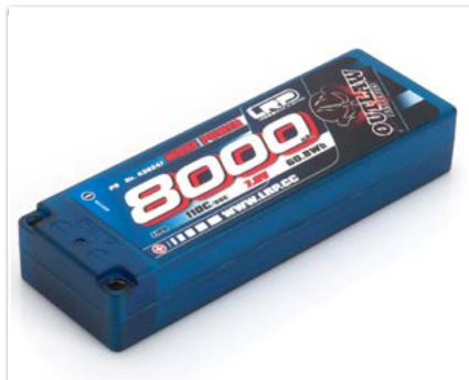
LRP 8000 Stickpack P5 LiPo Outlaw