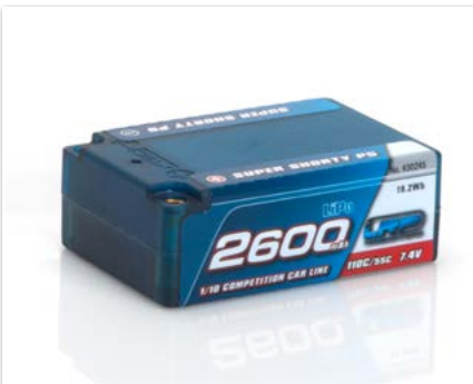
LRP 2600 - Super Shorty P5 - 7.4V LiPo