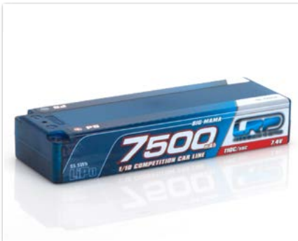
LRP 7500 - Big Mama P5 - 7.4V LiPo