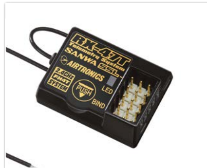
Sanwa RX-47T Receiver (2.4GHz / Telemetry)