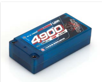
LRP 4900 Shorty P5 LiPo Outlaw